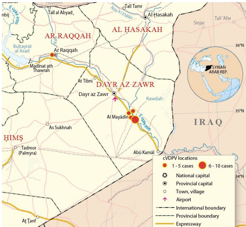
The boundaries and names shown and the designations used on this map do not imply official endorsement or acceptance by the United Nations.