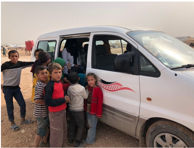
A mobile vaccination team arrives in Al-Arysha IDP camp, Hasakah governorate during the sub-national immunization campaign.