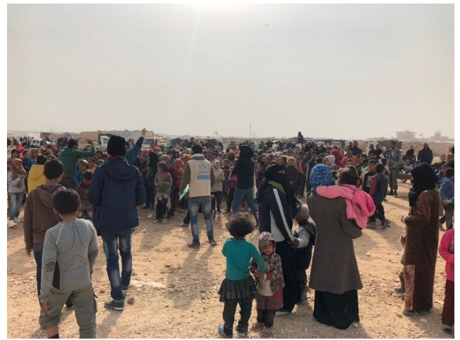
Social Mobilisers inform displaced families at Al-Arysha IDP camp, Hasakah governorate, about the importance of vaccination during the sub-national immunization campaign in November.