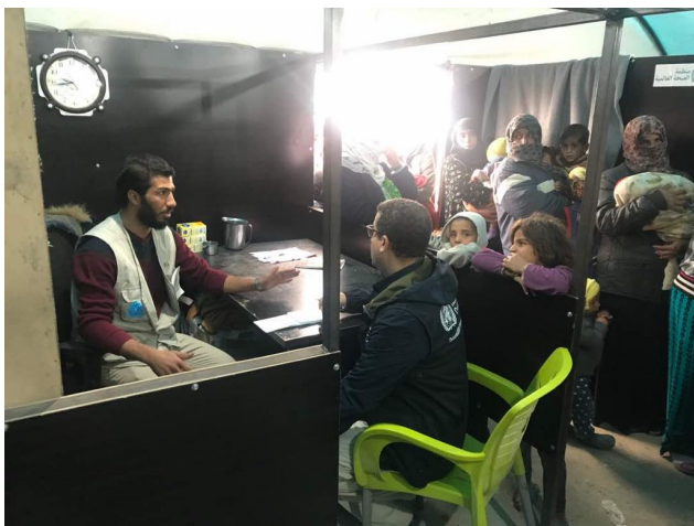
A physician receives an AFP surveillance orientation session at a WHO-supported clinic in Ein Eisa IDP camp, Raqqa governorate.