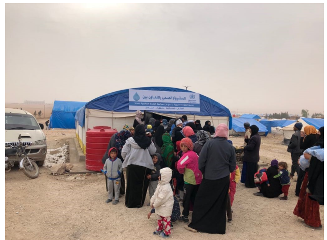
People line up outside a WHO-supported clinic in Ein Eisa IDP, Raqqa governorate for access to health services, including polio vaccination.