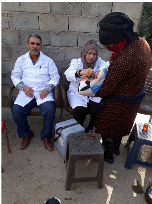
Above: a baby is vaccinated in newly accessible areas of Deir Ez-Zor.