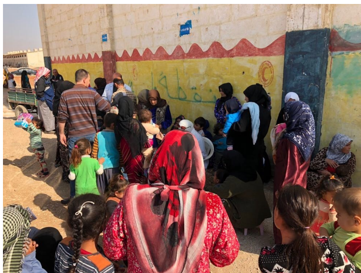
Above: Vaccination activities to reach children under 5 in Jebrin IDP camp, Aleppo city.