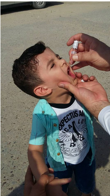
Four thousand children were vaccinated for the first time in Anbar province, Iraq (bordering Syria) in a bOPV-IPV campaign in September 2017.