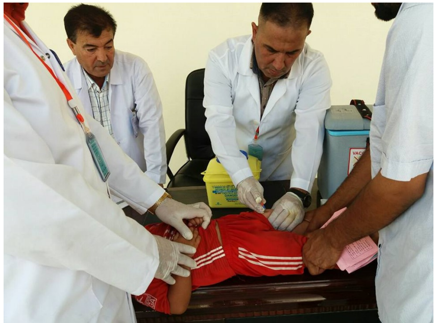
More than 90,000 children aged between 0-23 months received IPV in the September bOPV-IPV campaign, Anbar province, Iraq.