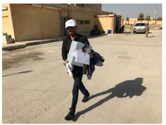
A vaccinator setting out to the field.