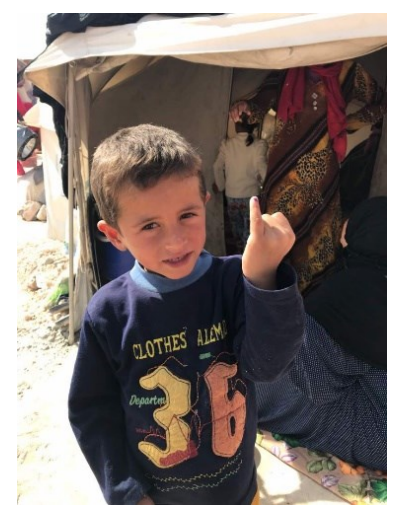
Young boy shows his 'pinky' finger, which has been marked after vaccination.