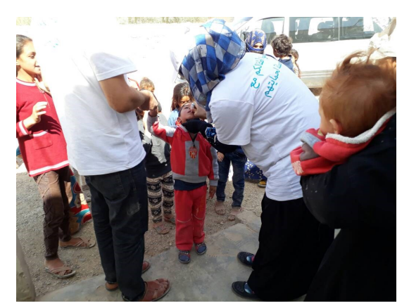
mOPV2 vaccination, Raqqa.