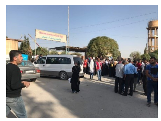
Teams in Tell Abyad getting ready to move to the field. First day of round.