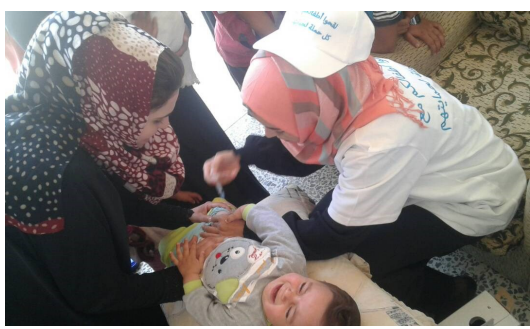
A child is vaccinated with IPV, Raqqa.