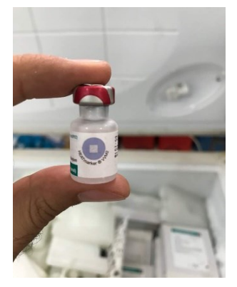
mOPV2 arriving in Raqqa in good condition.

• The country and all governorates but two are meeting both key indicators for AFP surveillance: 3 or more non-polio AFP cases per 100,000 children below 15 years of age, and 80 percent or above AFP cases with adequate specimens. Raqqa (79%) and Rural Damascus (72%) are missing the target for stool adequacy.