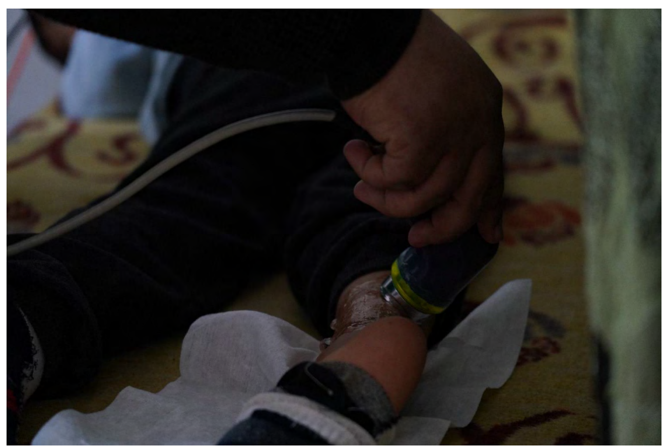
WHO-supported rehabilitation session for a child in Northwest Syria.