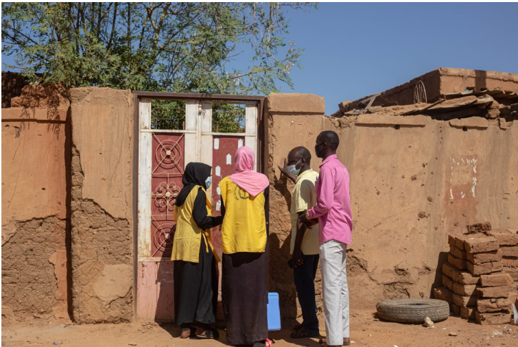
Social mobilisers and vaccinators outside a home in Khartoum during R1.