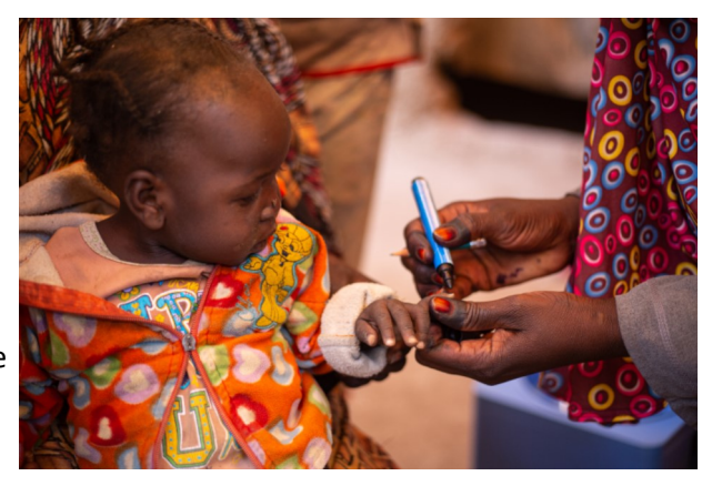
A child living in a camp for internally displaced persons has her finger marked after vaccination.