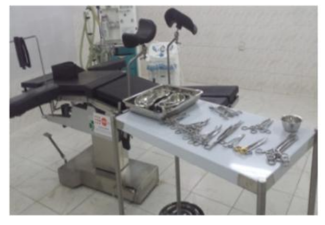
Equipping the theatre of a Fistula Centre in South Darfur

This will equip patients with some skills and help them build on to whatever they have and continue their journey.