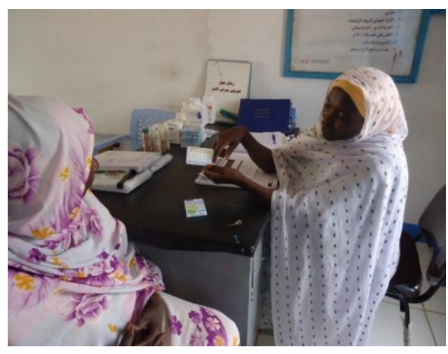
A midwife explains various family planning methods.

Family planning service provision by IMC in Darfur For the last several years, IMC has been providing continuous, tailored health education messages to mothers and community leaders in Darfur about available family planning methods and the benefits of family planning to women's health. As a result of its strong behavior change community approach, IMC has successfully scaled up the use of modern family planning methods, even in remote areas of Central Darfur.