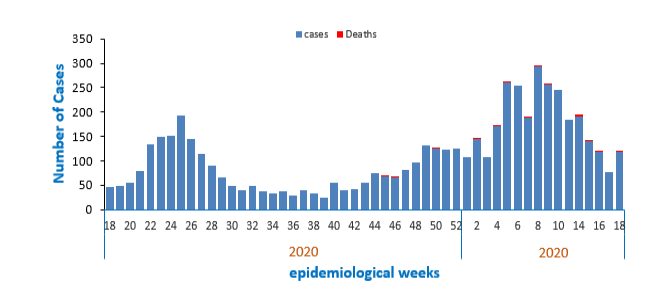
Distribution of cholera cases from December 2017 to week 18/2020