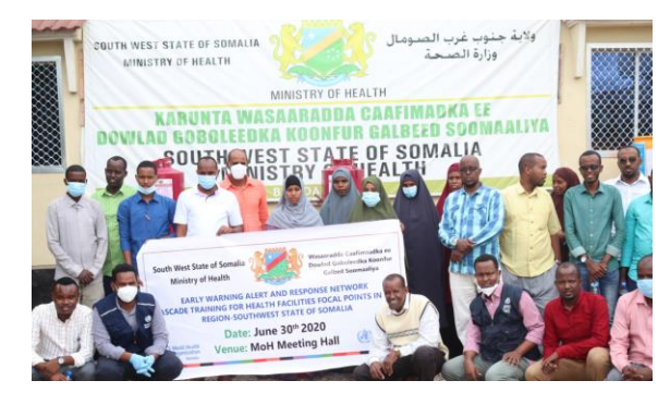
Early warning alert and response network cascade training for health facilities in Bay region on 30 June 2020

The Health Emergencies Programme of WHO Somalia is supported by the UN OCHA Central Emergency Response Fund (CERF)