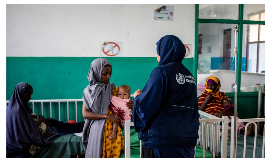
WHO PHEO is providing support supervision to Banadir Mother and child General Hospital in July 2020

Required for WHO's health emergency programme