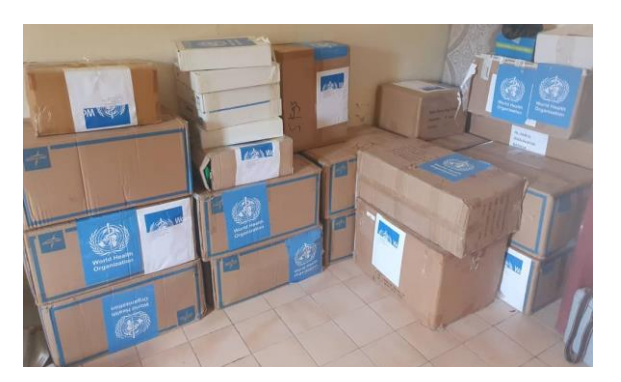
WHO providing PPEs and sample collection kits to Baidoa, Afgoye, Marka, Baraawe, Elberde and Hudur district on 28 July 2020.