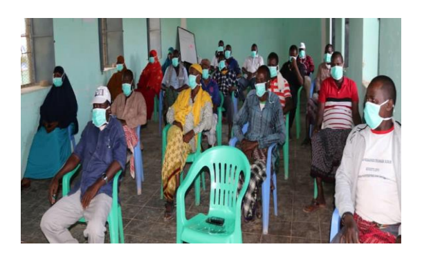
DFAs and social mobilizers training on COVID-19 awareness and prevention in Hudur District on 7 July 2020