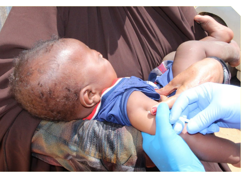
A child receiving measles vaccine in response to the outbreak in Kismayo , September 2020