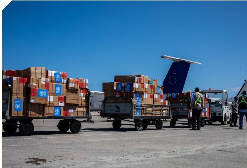
An EU flight transports WHO supplies designated to flood affected IDPS in Beletweyen and Jowhar, September 2020