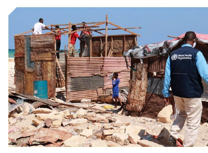
A WHO staff surveys the damage from Cyclone Gati

Community health workers have continued to provide key messages to the community focusing on COVID-19 transmission, prevention and testing in order to limit the spread of the outbreak. In November and December, the teams reached out to 915 008 households (3 928 964 people) in order to share COVID-19 awareness messages through house-to-house visits as well as group communication.