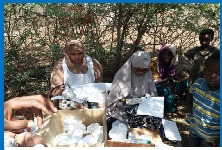
WHO-supported Integrated Emergency Response Teams (IERTs) providing outreach services

WHE Situation Report September, 2018 Situation Report No. 9