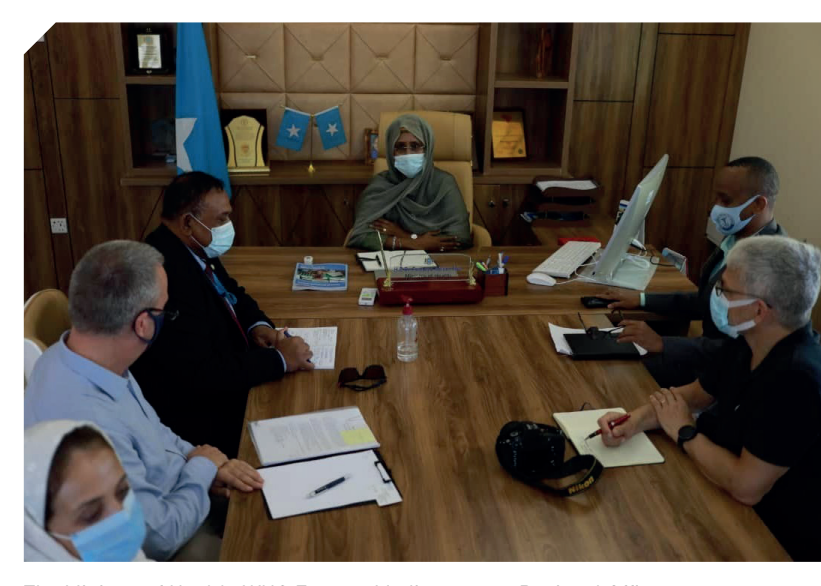
The Ministry of Health, WHO Eastern Mediterranean Regional Office (EMRO) and WHO Country Office in Somalia conducted a joint mission to Galmudug to review joint COVID-19 response activities in September 2021

WHO supports state health ministries in the management of cases of severe acute malnutrition (SAM) with medical complications in the districts affected by drought, floods, and conflict in Somalia. This is provided through technical support, training and the provision of supplies to nutritional stabilization centres in the country. The supplies provided include SAM kits, distributed to the state health ministries on a quarterly basis.