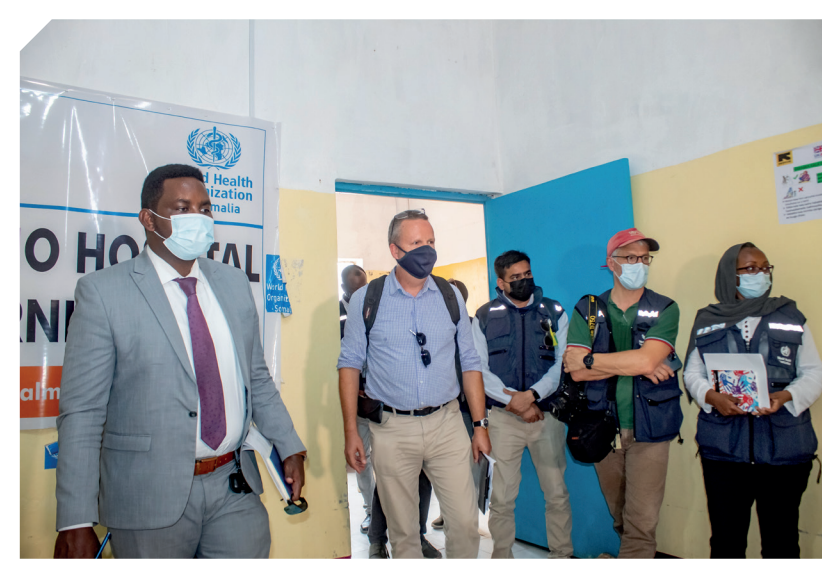
A mission from the Ministry of Health, WHO Eastern Mediterranean Regional Office (EMRO) and WHO Country Office in Somalia met with partners to review joint COVID-19 response activities @ WHO