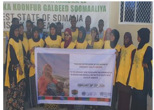
Training of IERTs continue to be conducted in Baidoa and other flood-affected areas supported by the UN-CERF