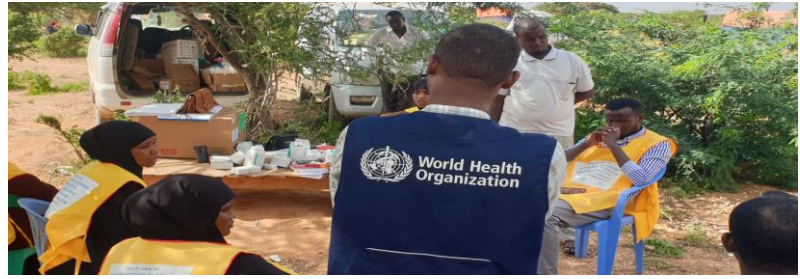
WHO supported mobile health clinics providing primary health care to flood affected IDPs in Eljale, Beletweyne