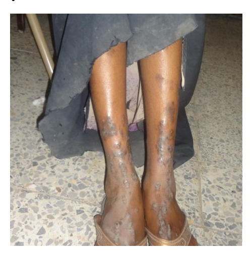
Fig. 2. Suspected cases of onchocerciasis