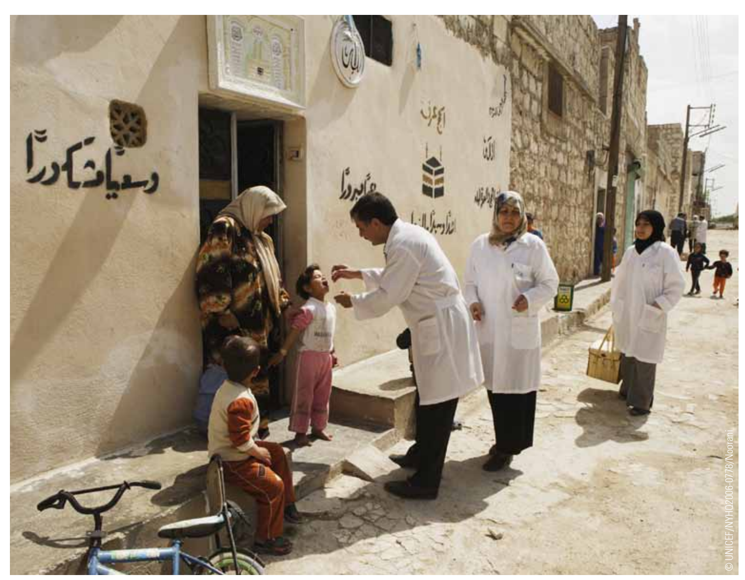
April 2006 - A child receives a dose of oral vaccine from a member of a mobile vaccination team in the Karm Al Afandi neighbourhood of the city of Aleppo. At that time, Syria had made considerable progress towards improving the situation of children and women and was on track to achieve almost all Millennium Development Goals.

Driving home the need for decisive action, the Director-General of the World Health Organization (WHO) declared on 5 May 2014 that the international spread of polio is a Public Health Emergency of International Concern<sup>[1]</sup>. This is only the second time WHO has ever issued such a declaration. The international spread of polio during what is normally the low-transmission season, including within the Middle East, is an extraordinary event that constitutes a major public health risk to other countries and requires a concerted international response.