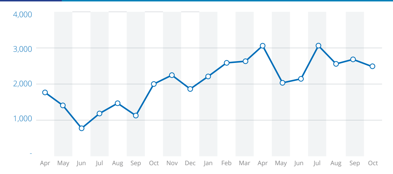
Chart 1: Total number of referrals approved for Gaza patients, April 2017 - October 2018

approved for financial coverage for Gaza patients outside the Palestinian Ministry of Health