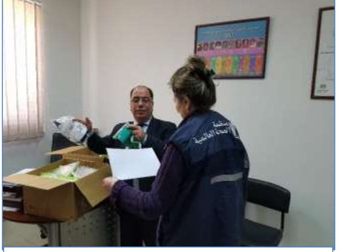
WHO and MoH staff examine the content of the PPE Kit delivered by WHO.