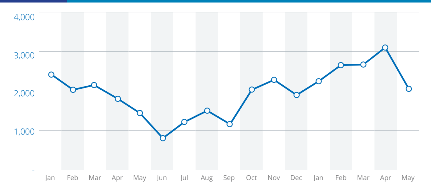
Chart 1: Total number of referrals approved for Gaza patients, Jan 2017 - May 2018

approved for financial coverage for Gaza patients outside the Palestinian Ministry of Health