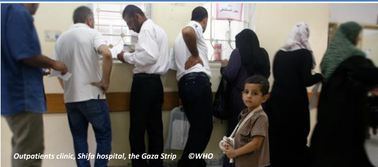
Outpatients clinic, Shifa hospital, the Gaza Strip