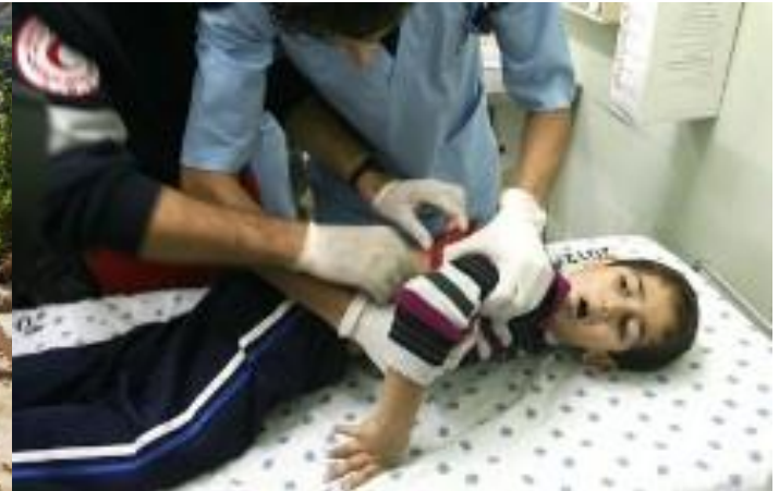
Left: A 9-year-old boy was injured in his back when a rocket hit in front of his home where his mother was baking bread in Qarara village, Gaza, November 18. His 2-year-old brother was killed and other family members were injured. Right: The child is being treated in the emergency room of Nasser Hospital in Khan Younis.