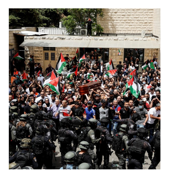
Police inside the grounds of St Joseph Hospital, Jerusalem.

In May, Israeli forces attacked St Joseph Hospital in East Jerusalem during the funeral of renowned Al Jazeera journalist Shireen Abu Akleh. The pallbearers were beaten, with police firing tear gas grenades, sound bombs and rubber bullets in the grounds of the hospital. Armed police entered the hospital building causing intimidation of patients and staff. The hospital recorded 13 injuries requiring medical attention resulting from violence carried out inside the hospital grounds.