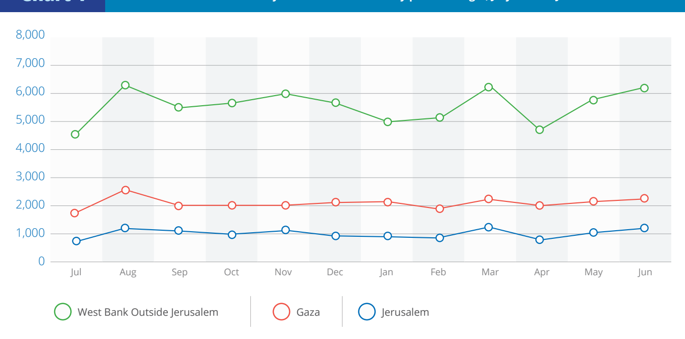
Chart 1 Number of referrals issued by the Palestinian MoH by place of origin, July 2021 to June 2022

referrals approved financial coverage for health care outside the Palestinian Ministry of Health