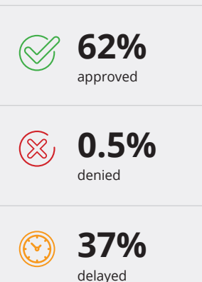
Table 1 Approval rate for patient permit applications in June 2022, by age and sex

to Israeli authorities to cross Beit Hanoun/Erez to access health care