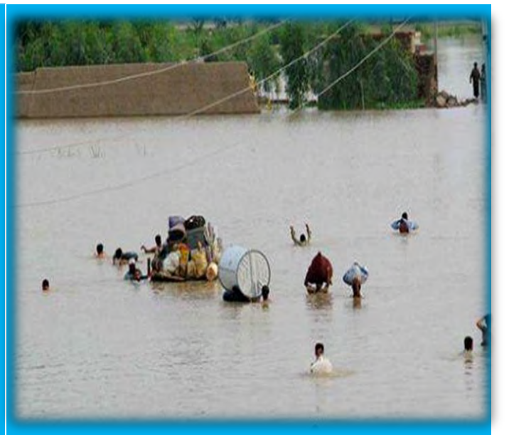
People evacuating with their belongings from affected village of Sialkot