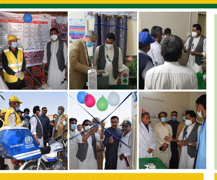
Daily Incidence and Deaths