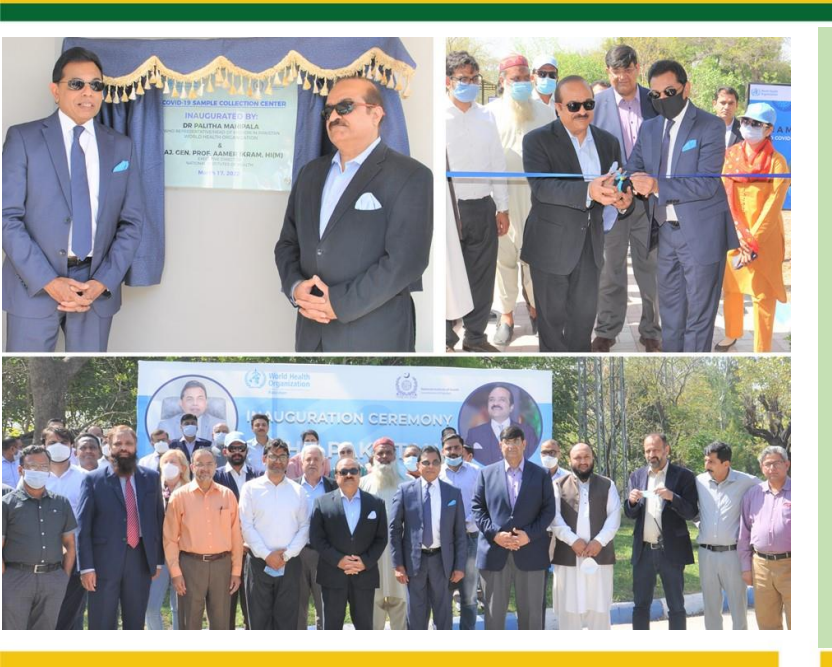
Daily Incidence and Deaths