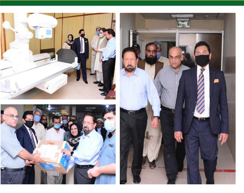
Daily Incidence and Deaths