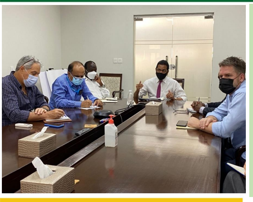
Daily Incidence and Deaths