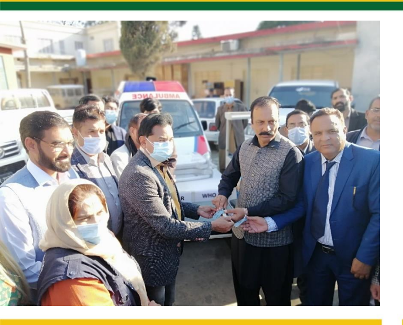
Daily Incidence and Deaths