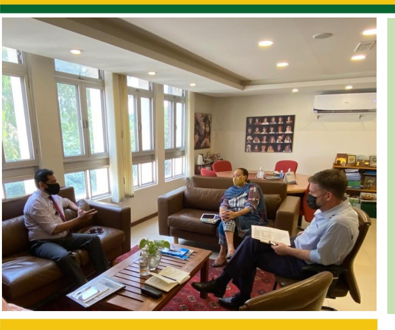
Daily Incidence and Deaths