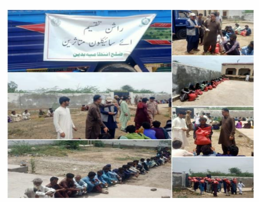
The cyclone BIPARJOY evacuees receiving relief items in Badin, Sujawal, and Thatta districts.