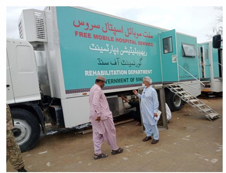
Mobile Hospital Services deployed at affected district from Rehabilitation Department, Government of Sindh