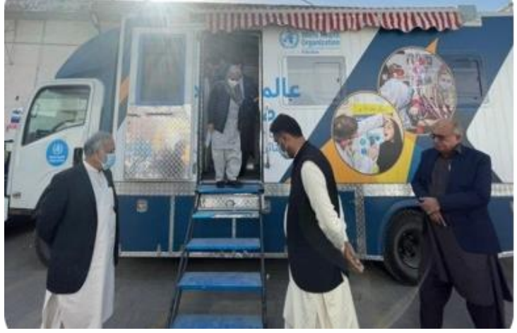
WHO Mobile vans deployed in Tharpark, Badin and Thatta supporting medical camps activities.