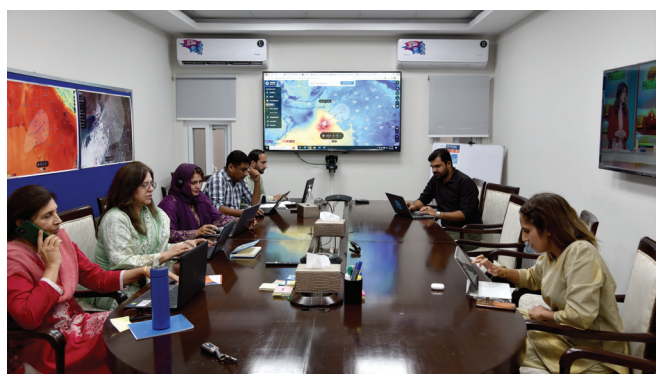
WHO staff working at the SHOC rooms at WHO Country Office Islamabad