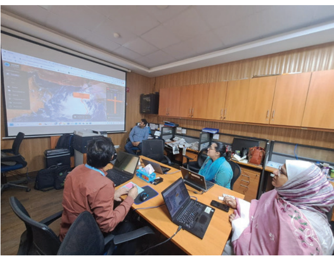
Provincial Sub Office staff working at SHOC room in WHO Karachi office