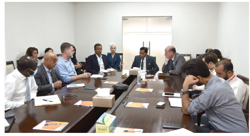
Health Partner Meeting on Tropical Cyclone "BIPARJOY" at WHO Pakistan Country Office, dated 13 june, 2023