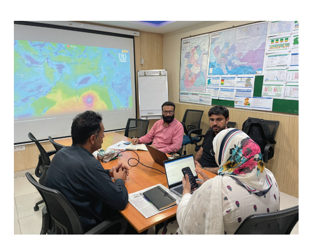
Meeting on Tropical Cyclone "BIPARIOY" at SHOC Room WHO Pakistan Sindh Sub-Office