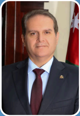
Prof. Feras Hawari Minister of Health

The Hashemite Kingdom of Jordan is proud of the progress made in strengthening our healthcare system as a key pillar of our Economic Modernization Vision. With the generous support of the European Union and the strategic partnership of WHO, we have expanded healthcare access, empowered our workforce, and reinforced our commitment to universal health coverage. Investing in a resilient and inclusive health sector is fundamental to driving economic growth and sustainable development. We extend our gratitude to our partners for their unwavering support in advancing health for all.