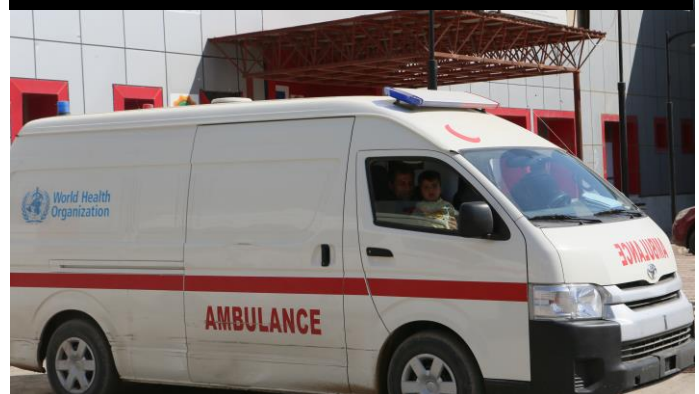
WHO supported trauma and ambulatory health care services in Mosul