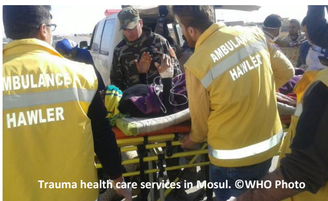
Trauma health care services in Mosul.