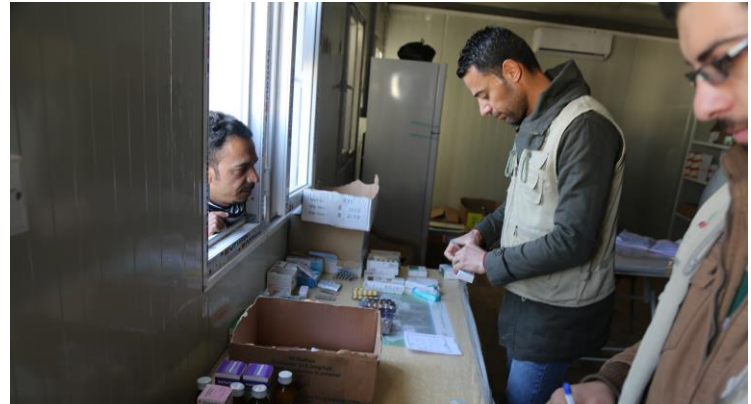
Pharmacist in Qayyara airstrip primary health care clinic dispensing drugs for hundreds of internally displaced persons seeking health services.