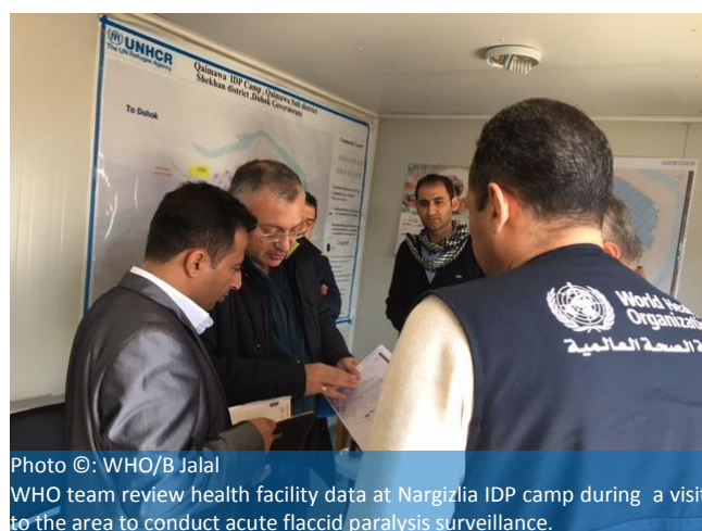
WHO team review health facility data at Nargizlia IDP camp during a visit to the area to conduct acute flaccid paralysis surveillance.