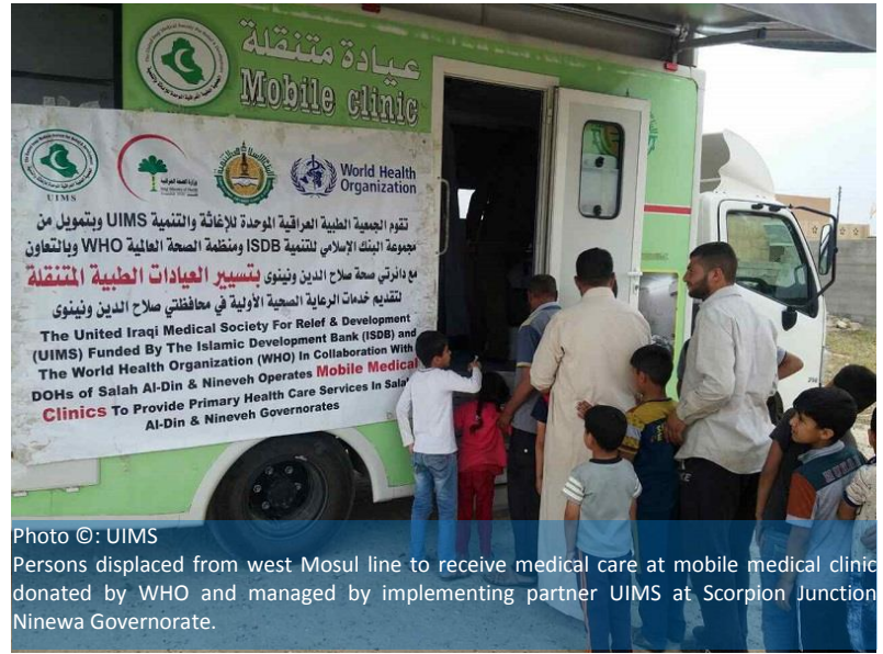
Persons displaced from west Mosul line to receive medical care at mobile medical clinic donated by WHO and managed by implementing partner UIMS at Scorpion Junction Ninewa Governorate.