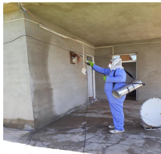
A member of Dahuk Directorate of Health fumigation team sprays a house in Sinjar district, Ninawa Governorate