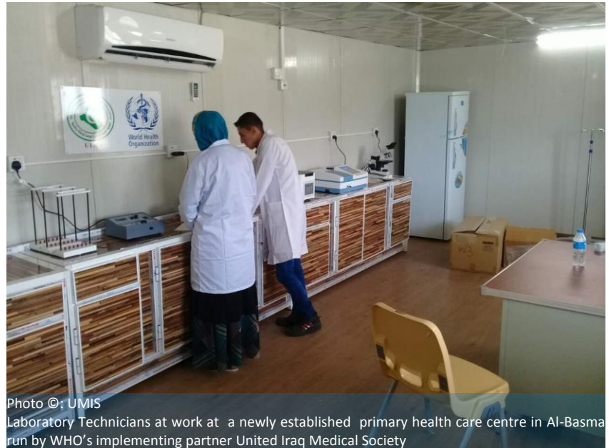
Photo ©: UMIS Laboratory Technicians at work at a newly established primary health care centre in Al-Basma run by WHO's implementing partner United Iraq Medical Society