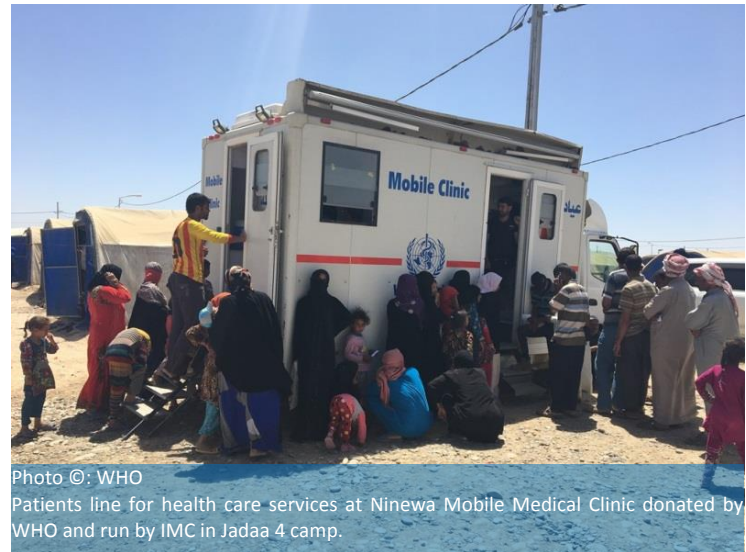
Patients line for health care services at Ninewa Mobile Medical Clinic donated by WHO and run by IMC in Jadaa 4 camp.