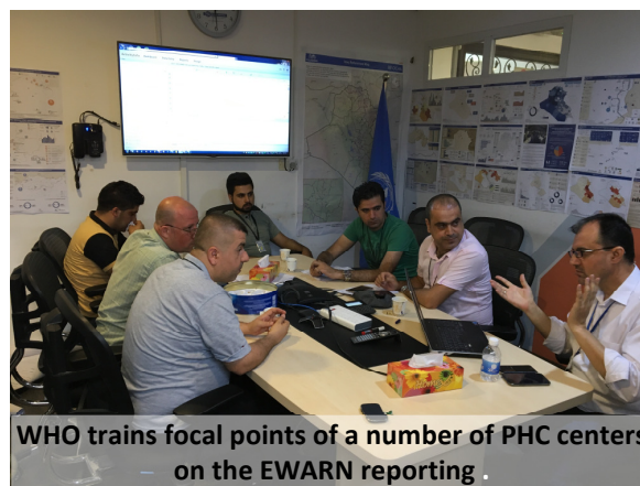
WHO trains focal points of a number of PHC centers on the EWARN reporting .