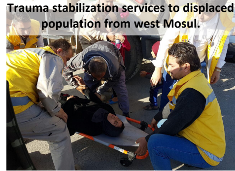
Trauma stabilization services to displaced population from west Mosul.