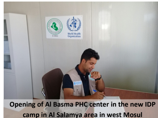
Opening of Al Basma PHC center in the new IDP camp in Al Salamya area in west Mosul