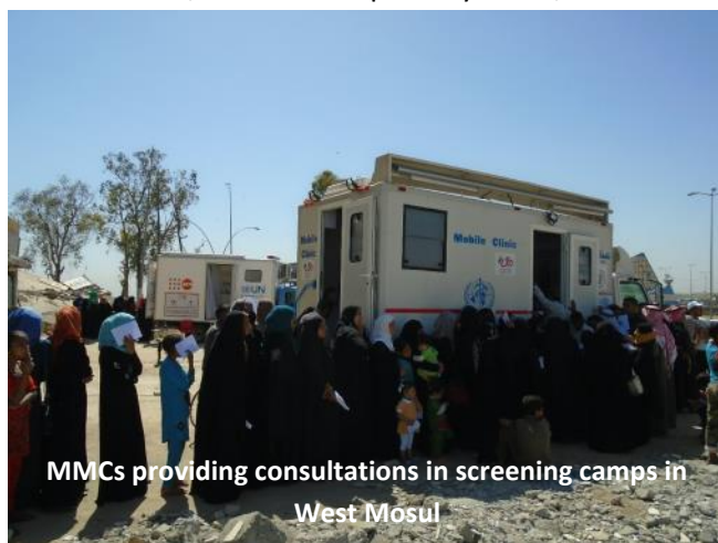
MMCs providing consultations in screening camps in West Mosul