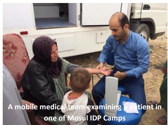
A mobile medical team examining a patient in one of Mosul IDP Camps