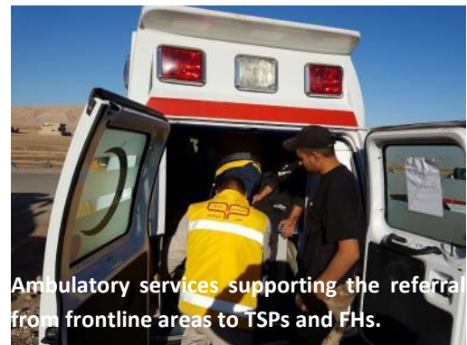
Ambulatory services supporting the referral from frontline areas to TSPs and FHs.