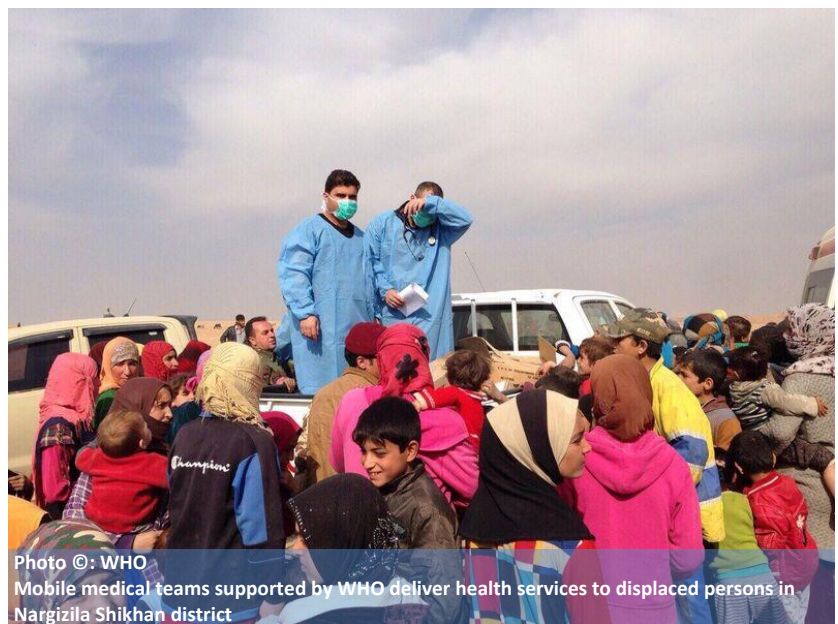
Mobile medical teams supported by WHO deliver health services to displaced persons in Nargizila Shikhan district