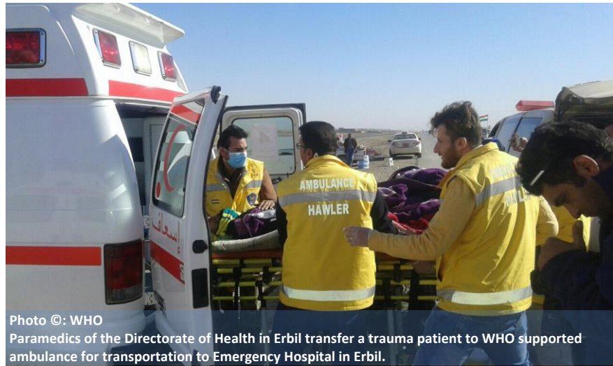
Photo ©: WHO Paramedics of the Directorate of Health in Erbil transfer a trauma patient to WHO supported ambulance for transportation to Emergency Hospital in Erbil.