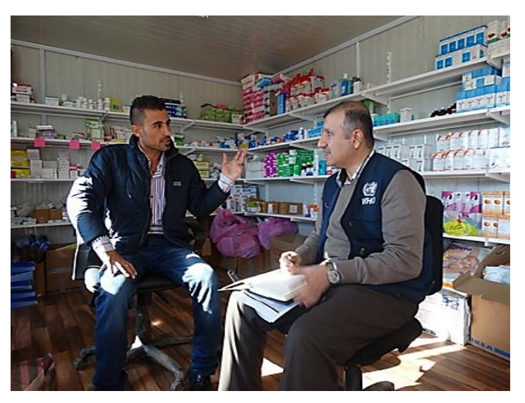
WHO staff meets with a pharmacist in a primary health care unit in Bajet Kandala camp during as assessment mission

WHO team, visited Mart Shmoony Charitable Medical Unit and Harsham IDP camp, and noticed the lack of