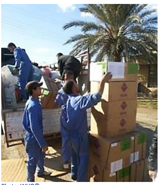
Preparation of the Interagency Emergency Health Kits which were delivered Duluiayah district as part of a humanitarian convov

As part of a joint humanitarian response mission, WHO delivered five basic units of Interagency Emergency Health Kits (IEHK) to serve the population in Dhuluiya that was inaccessible for seven months. The Primary Health Care Centre (PHCC) in Dhuluiya was affected and rendered non-functional, currently health services are being provided from a rented house. The commodities delivered will cover the needs of 5000 people for three months. Additional three basic units of Interagency Emergency Health Kits (IEHK)