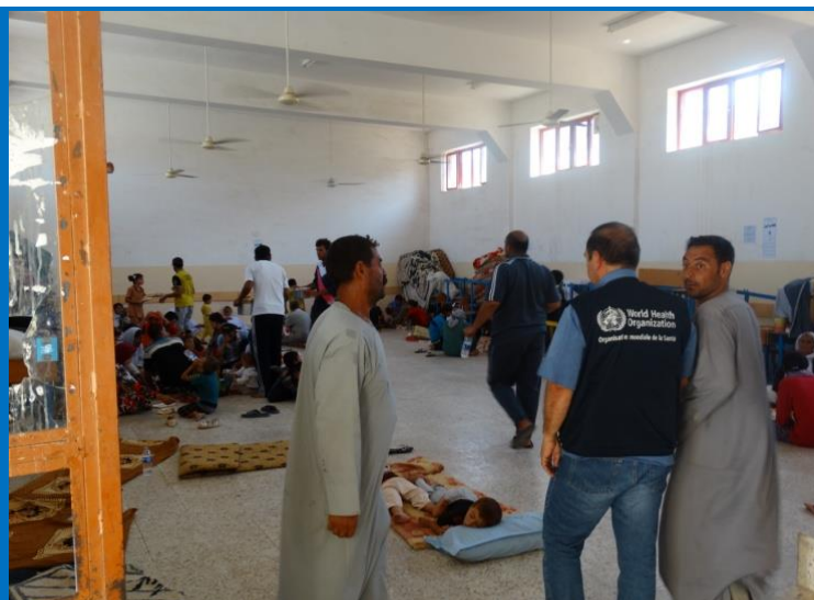
IDPs in Khanik town, Dohuk