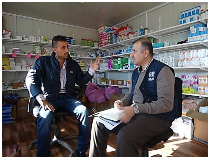
WHO staff meets with a pharmacist in a primary health care unit in Bajet Kandala camp during an assessment mission

WHO team, visited Mart Shmoony Charitable Medical Unit and Harsham IDP camp, and noticed the lack of vaccination services in both camps. The team reported these gaps through the health cluster, and in close collaboration with the DOH, action will be taken to ensure that preventive services including vaccination are provided to the health facilities in IDP camps.