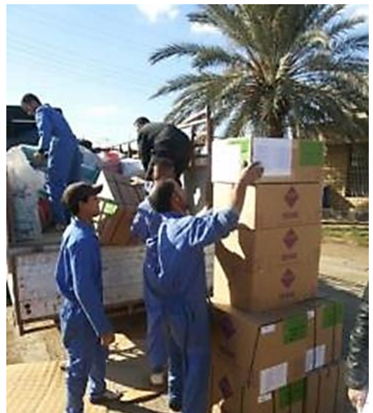
Preparation of the Interagency Emergency Health Kits which were delivered Duluiayah district as part of a humanitarian convoy