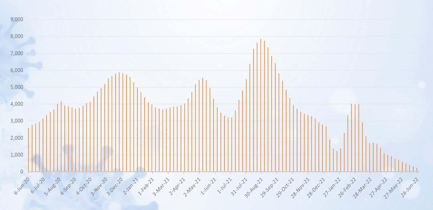
Figure 2. Weekly Trend of COVID-19 Cases in ICU, 06 June 2020-25 June 2022